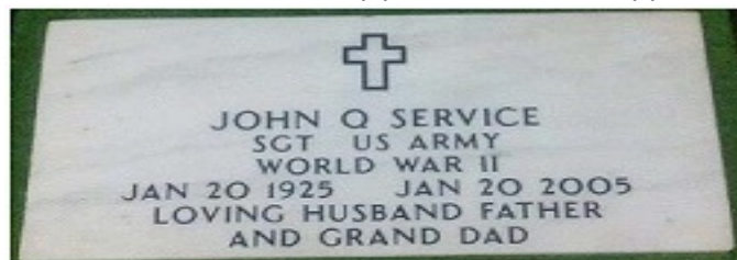
LIGHT GRAY GRANITE (G) OR WHITE MARBLE (F)

This grave marker is 24 inches long, 12 inches wide, and 4 inches thick. Weight is approximately 130 pounds. Variations may occur in stone color; the marble may contain light to moderate veining.