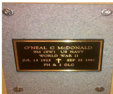
BRONZE NICHE (Z)

This niche marker is 8-1/2 inches long, 5-1/2 inches wide, with 7/16 inch rise. Weight is approximately 3 pounds; mounting bolts and washers are furnished with the marker. Used for columbarium or mausoleum interment. Also provided to supplement a privately-purchased headstone or marker for eligible Veterans who died on or after November 1, 1990 and are buried in a private cemetery.