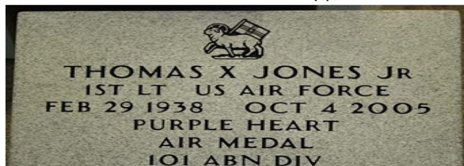
SMALL FLAT GRANITE (L)

This grave marker is 18 inches long, 12 inches wide, and 3 inches thick. Weight is approximately 70 pounds. Variations may occur in stone color.