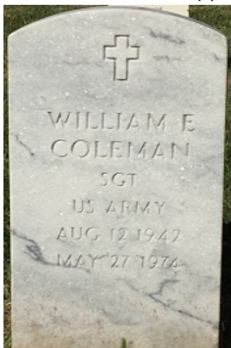
UPRIGHT HEADSTONE WHITE MARBLE (U) OR LIGHT GRAY GRANITE (V)

This headstone is 42 inches long, 13 inches wide and 4 inches thick. Weight is approximately 230 pounds. Variations may occur in stone color, and the marble may contain light to moderate veining.